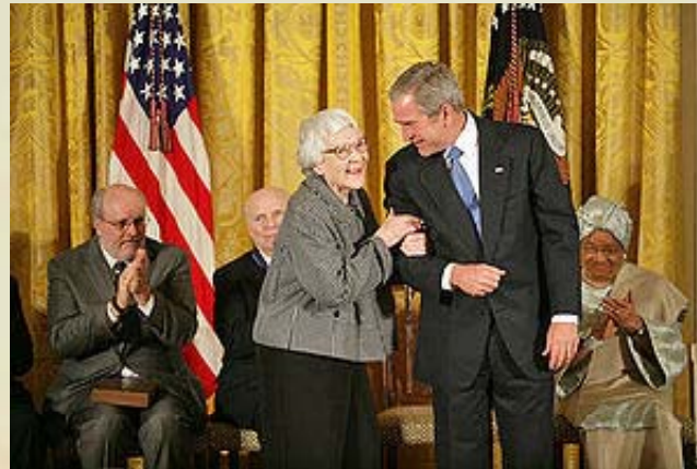
Harper Lee receives the Presidential Medal of Freedom Award