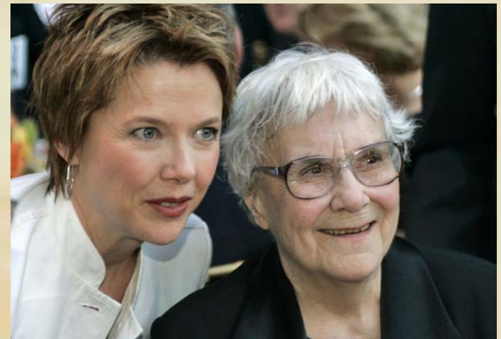
Harper Lee receives the National Medal of Arts Award

“It’s better to be silent than to be a fool”